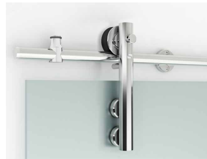
LUMINA-GF Door Weight: up to 198 lbs. Roller Dimension: 8 21/32 inches