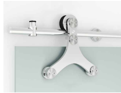
EIFFEL-GF Door Weight: up to 198 lbs. Roller Dimension: 6 1/2 inches