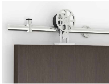
SPINNER-WT Door Weight: up to 176 lbs. Roller Dimension: 5 1/8 inches