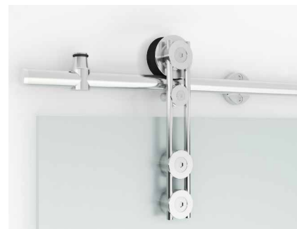
NOVA-GF Door Weight: up to 198 lbs. Roller Dimension: 8 1/2 inches