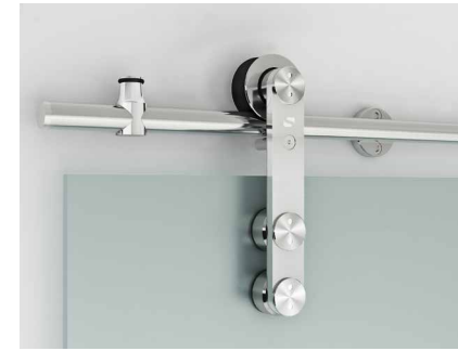
GRAND-GF Door Weight: up to 198 lbs. Roller Dimension: 8 15/32 inches