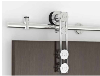
NOVA-WF Door Weight: up to 198 lbs. Roller Dimension: 8 1/2 inches