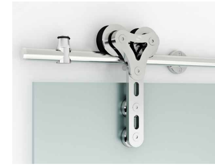
VICTORY-GF Door Weight: up to 240 lbs. Roller Dimension: 8 15/64 inches