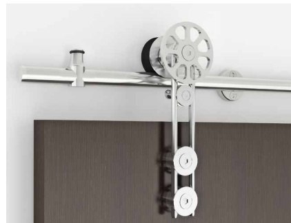
SPINNER-WF Door Weight: up to 198 lbs. Roller Dimension: 8 3/4 inches