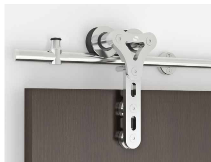
VICTORY-WF Door Weight: up to 198 lbs. Roller Dimension: 8 15/64 inches