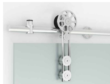
SPINNER-GF Door Weight: up to 198 lbs. Roller Dimension: 8 3/4 inches