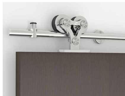
VICTORY-WT Door Weight: up to 240 lbs. Roller Dimension: 4 15/64 inches