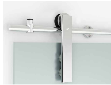
GALLANT-GF Door Weight: up to 198 lbs. Roller Dimension: 8 1/4 inches